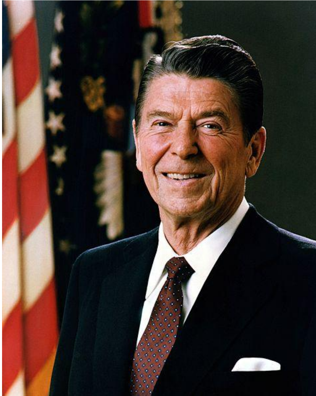
Ronald Reagan Foundation