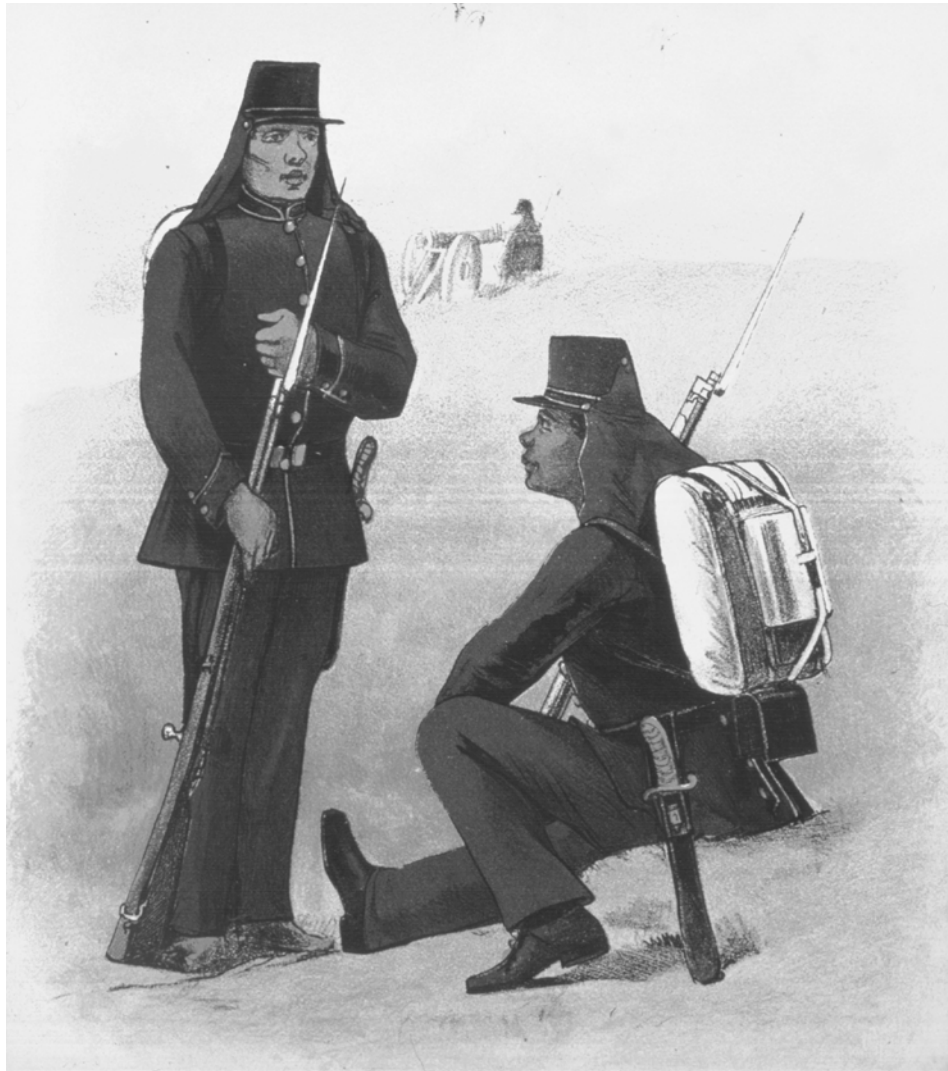
Native and African troops in the Netherlands East Indies army. The African soldier is wearing shoes, while the native is barefoot.